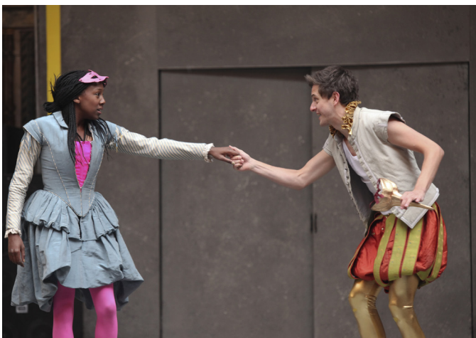
A 2013 production of Romeo and Juliet , one of Shakespeare's tragedies. Romance – both happy and sad – was a common theme for playwrights.

Comedies , on the other hand, could be relied upon for happy endings, often weddings. Shakespeare's Two Gentlemen of Verona is especially happy; it ends with two weddings! Other comedies were more satirical. Ben Jonson wrote The Alchemist to make fun of London society.