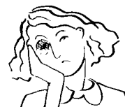
a black eye

I've got a cold / a cough / a sore throat / a temperature / a stomach ache / chest pains / earache / a pain in my side / a rash on my chest / spots / a bruise on my leg / a black eye / a lump on my arm / indigestion / diarrhoea / painful joints / blisters / sunburn. I feel sick / dizzy / breathless / shivery / faint / particularly bad at night. I am depressed / constipated / tired all the time. I've lost my appetite / voice; I can't sleep, my nose itches and my leg hurts.